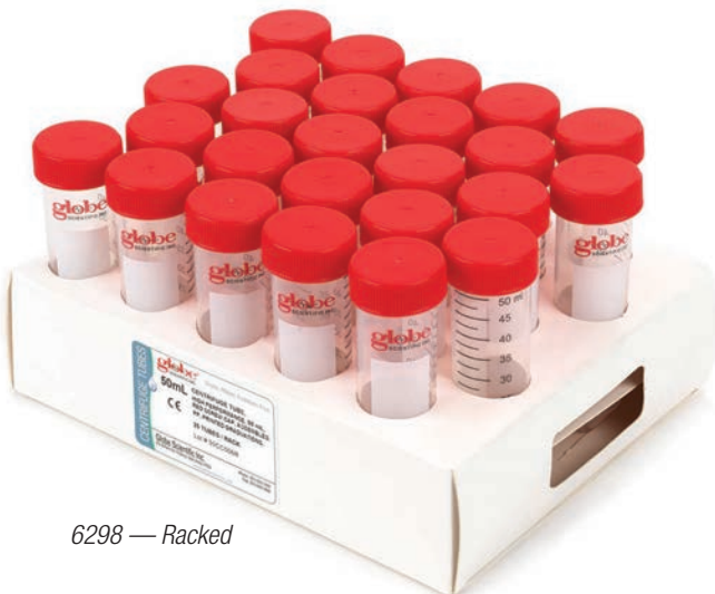
6298 — Racked